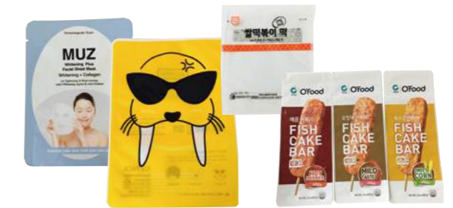
SIMPLE TYPE 3 SIDE SEALING