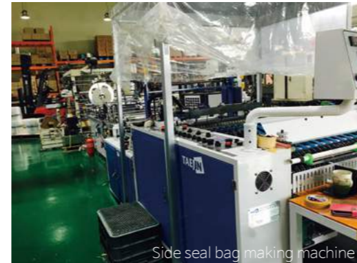
Side seal bag making machine