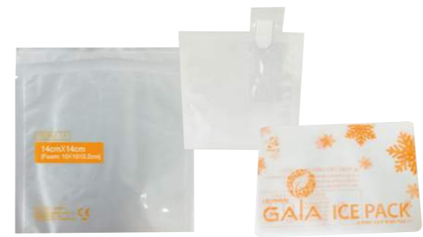
SPECIAL 3 SIDE SEALING