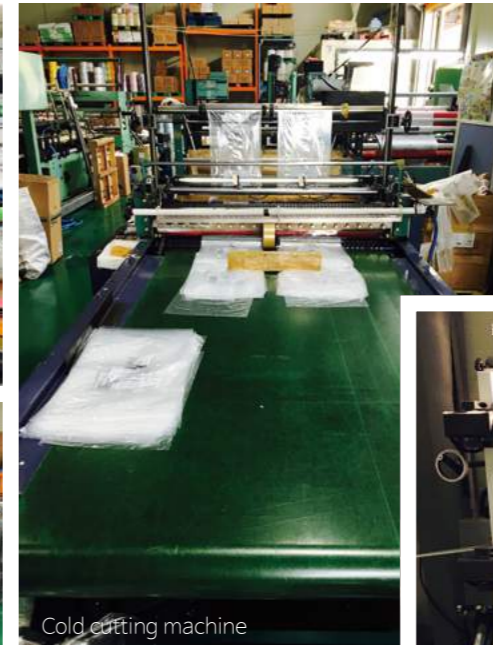
Cold cutting machine