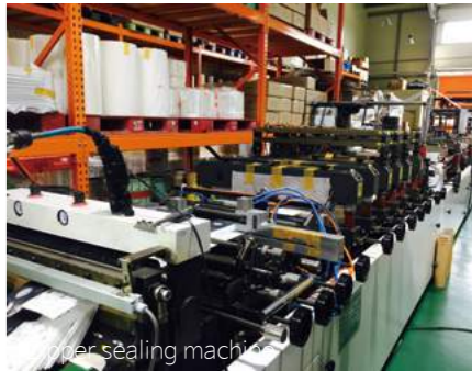
Water sealing machine