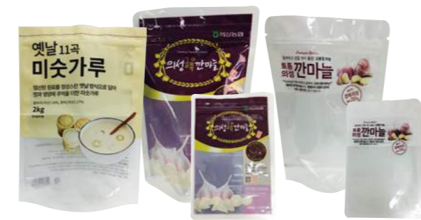
ZIPPER STAND TYPE 3 SIDE SEALING