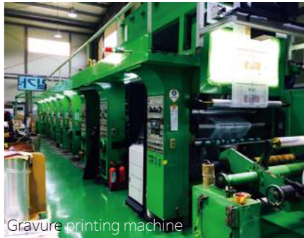
Gravure printing machine