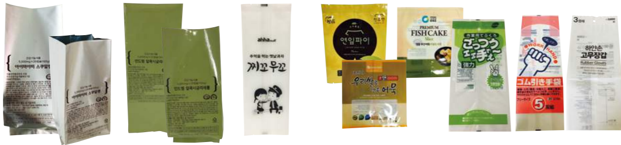
M TYPE SEALING