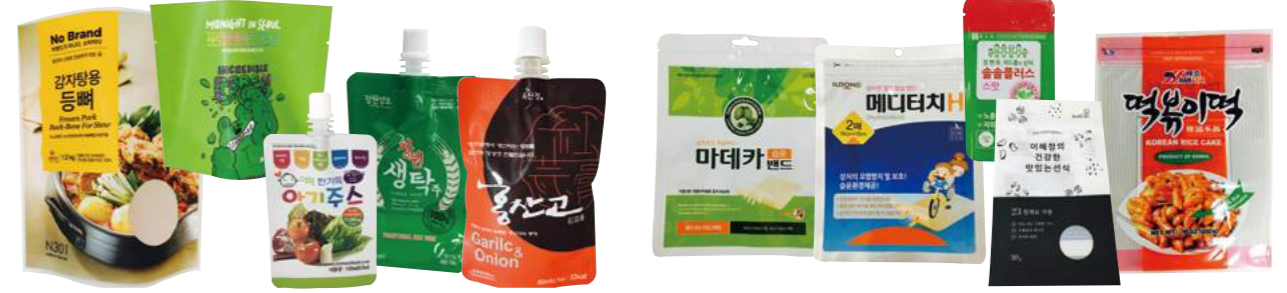
STAND TYPE 3 SIDE SEALING