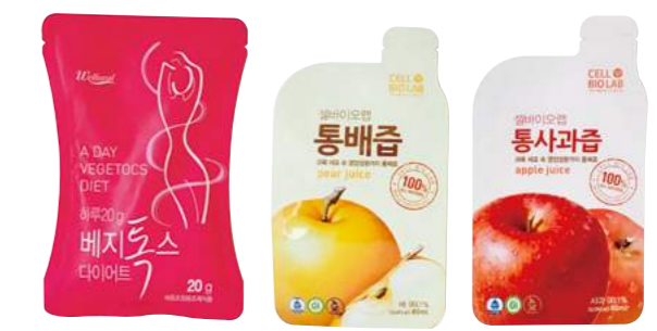
THOMSON TYPE 3 SIDE SEALING