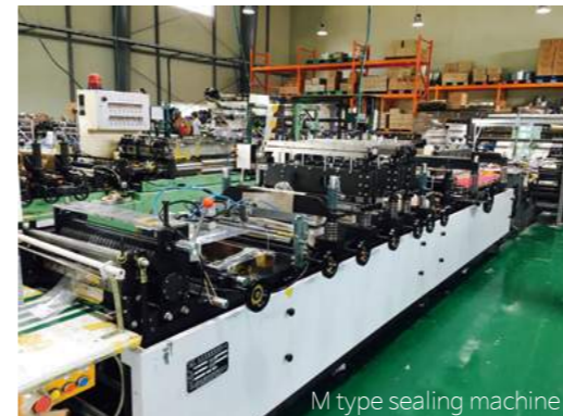
M type sealing machine