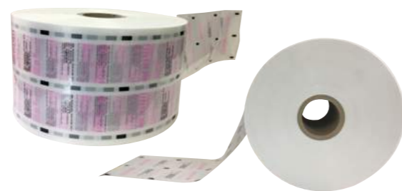
AUTO ROLL POUCH