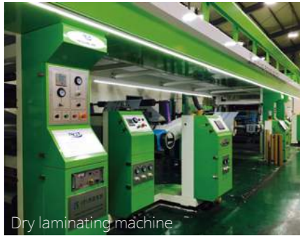
Dry laminating machine